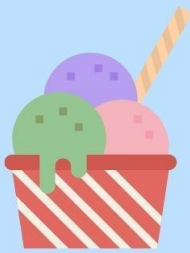
Ice Cream Cup